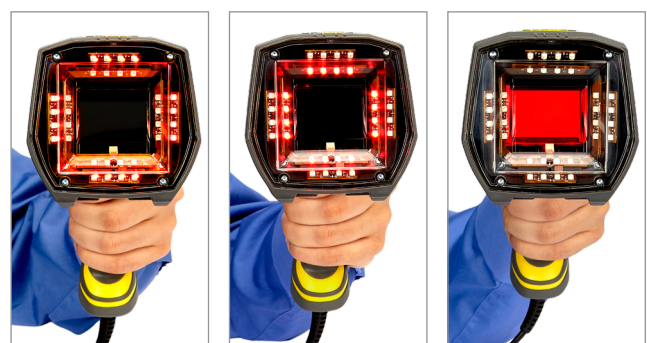
30-, 45-, and 90-degree lighting